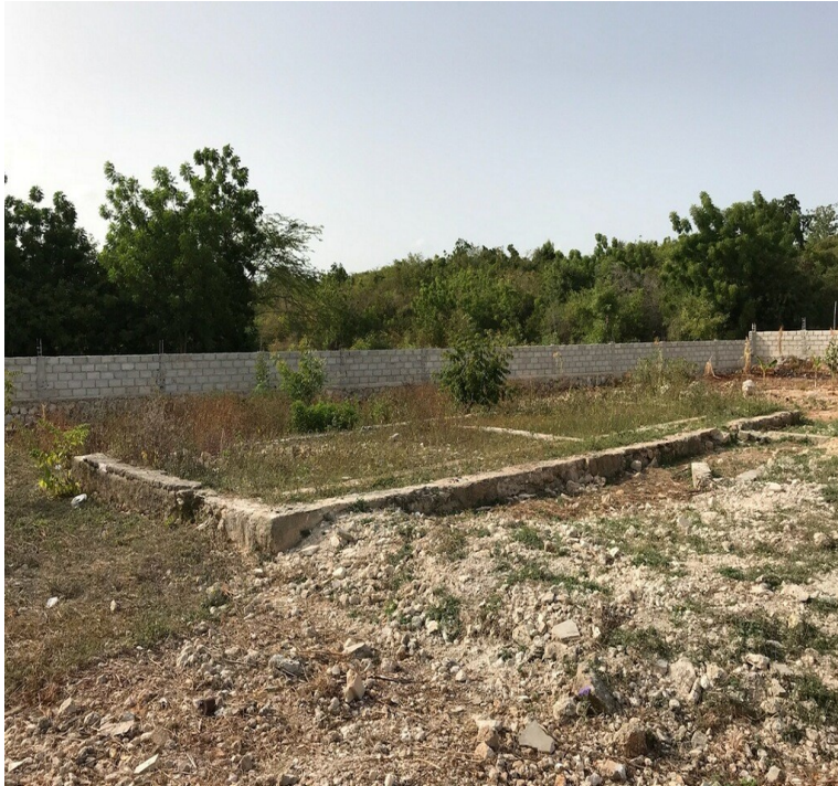
THE ORIGINAL LAND