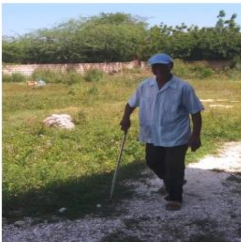
Image 11. Patient leaving the HSF clinic happy with free medication in his pocket.