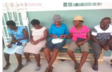
Image 3. Patients on deck waiting to be called.