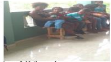
Image 9. Mothers and Children waiting for the medical staff