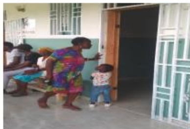
Image2. Elder Lady walking into the consultation room.