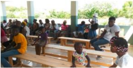
Image 10. Patients waiting to be called