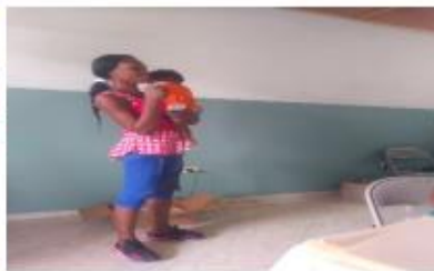
Image1. Elderly men and women including a mother with her child waiting to be seen by the medical staff.