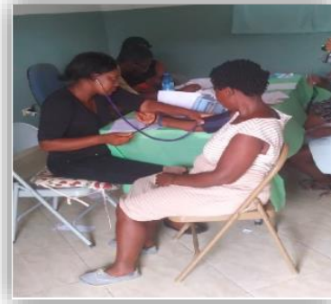
A nurse is taking vital signs to a patient at the HSF Clinic, Anse-a-Veau, while others wait their turn.