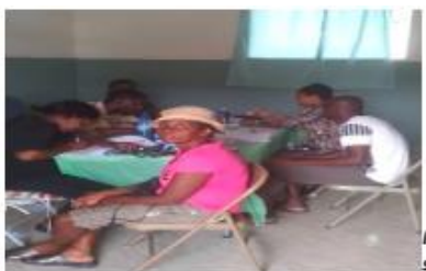
Image 6. Patients being seeing by the medical staff.