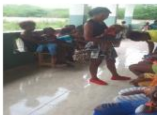
Image 5. Mothers holding their sick baby.